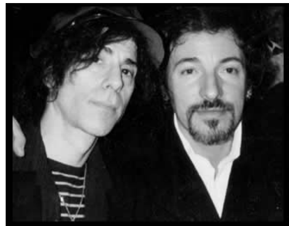
Peter Wolf with Bruce Springsteen

PETER WOLF (“PETER”) grew up in Brooklyn and studied art before getting into music, eventually as lead singer for J. Geils Band. The highlights of his career are far too many to list here – suffice it to say Peter keeps getting better!